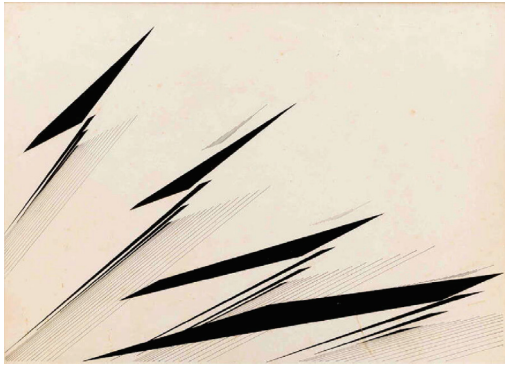
Figure : 2 Nasreen Mohamedi, Untitled, c.1975, ink and graphite on paper. Courtesy: the artist and Sikander & Hydari collection

contemplate the delicate balance between form and the infinite space that surrounds it.